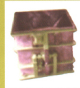
Flue Gas Duct Valves