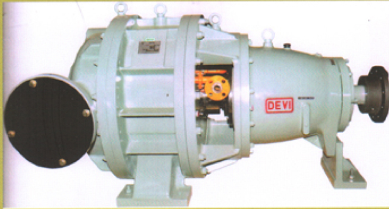
Liquid Ring Compressors