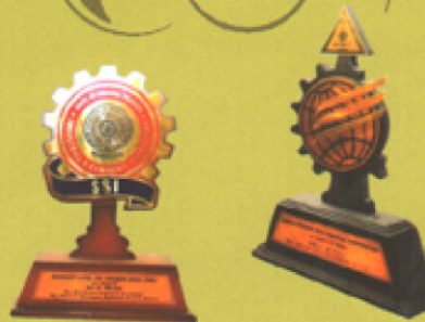
Awards for Excellency